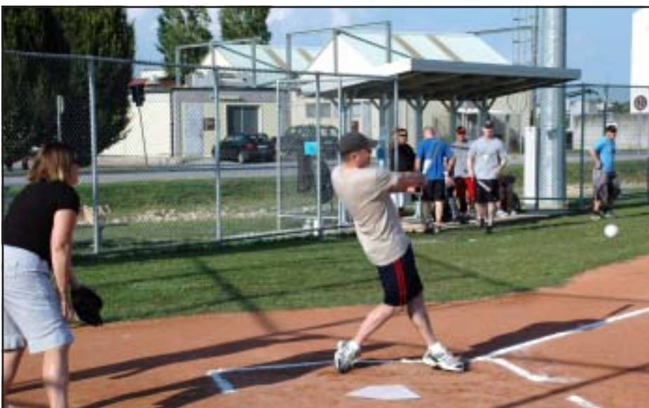
An HHC player connects with the ball during a July 20 softball game on post.