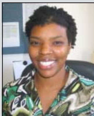
Tashima Beach Education Center

Flickr, MySpace, YouTube, Twitter, Facebook, others?